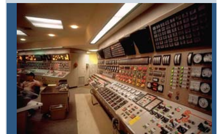
above) - ITLS OSG QC Inspectors at a nuclear power facility.