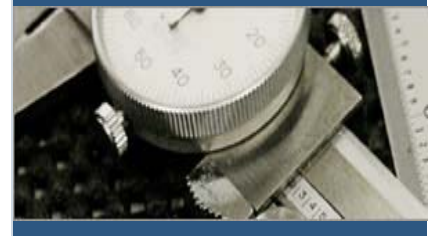
(below) – one of the topics our Quality Program addresses is the control of M&TE.